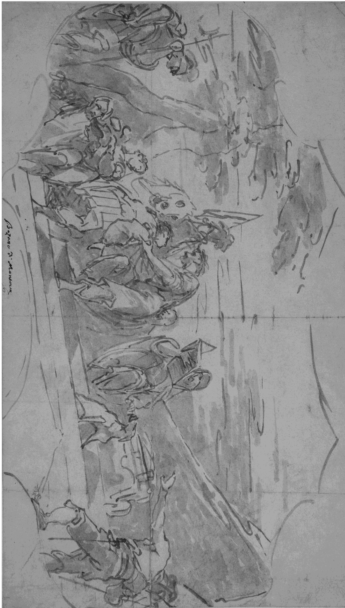
'Study of a ceiling panel', Giuseppe Bazzani, date unknown. Pen and wash on paper.