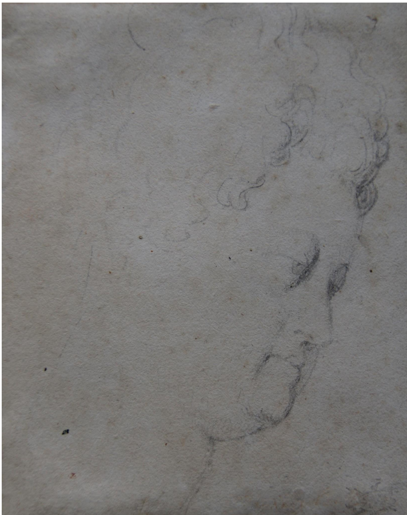
'Study for the Head of Marie de' Medici, Peter Paul Rubens, date unknown. Black chalk on paper.