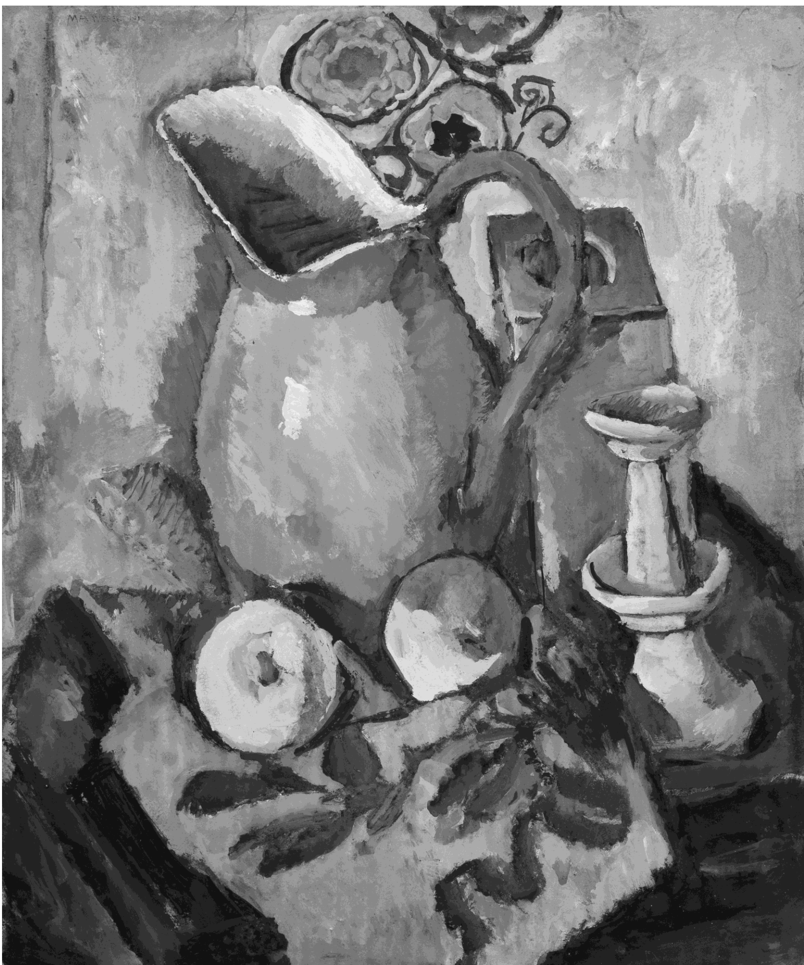
'Still Life I', Max Weber, 1910 . Watercolour on cardboard.