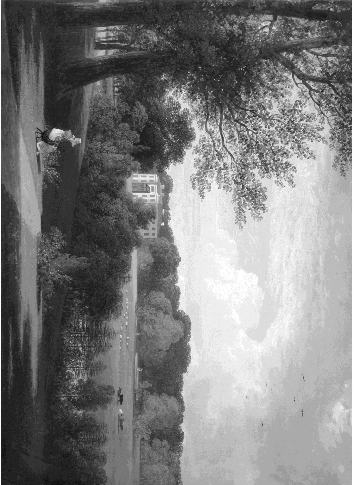
'A View of White Knights from the Park with a Lady sketching', Thomas Christopher Hofland, c1816. Oil on canvas.