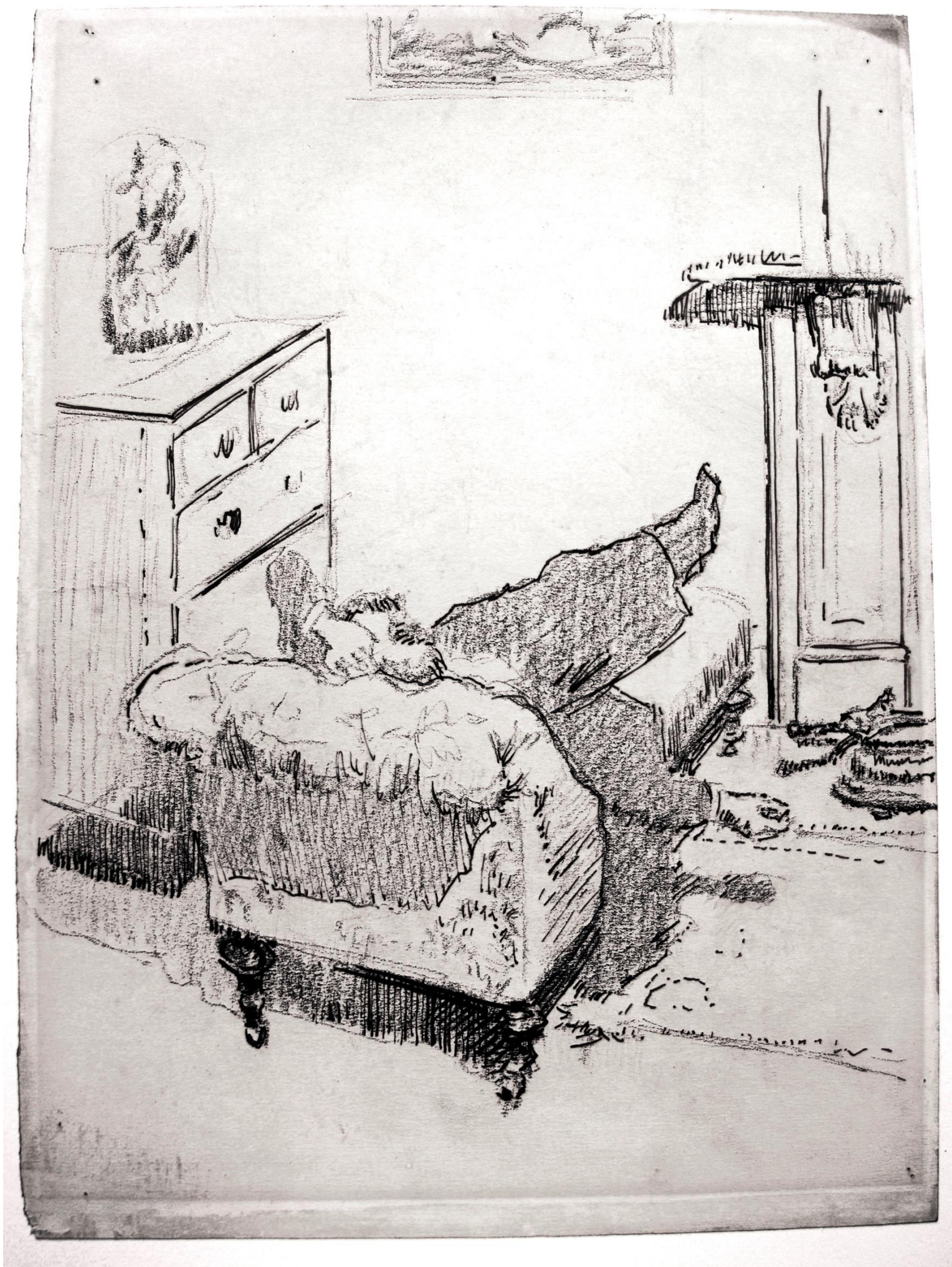
'Woman Laying on a Couch', Walter Sickert, c.1912. Pen, ink and crayon on wove paper.