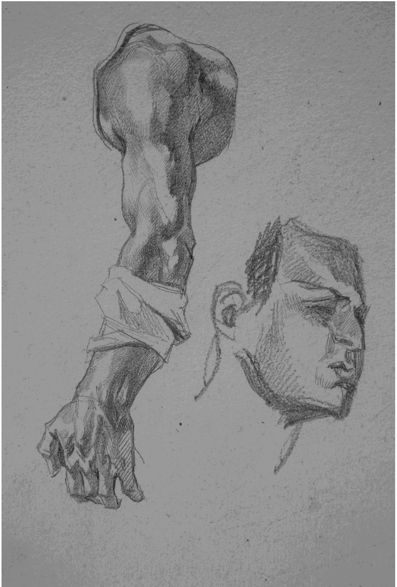
'Study of a Head and Arm', Eugène Delacroix, date unknown. Pencil on paper.