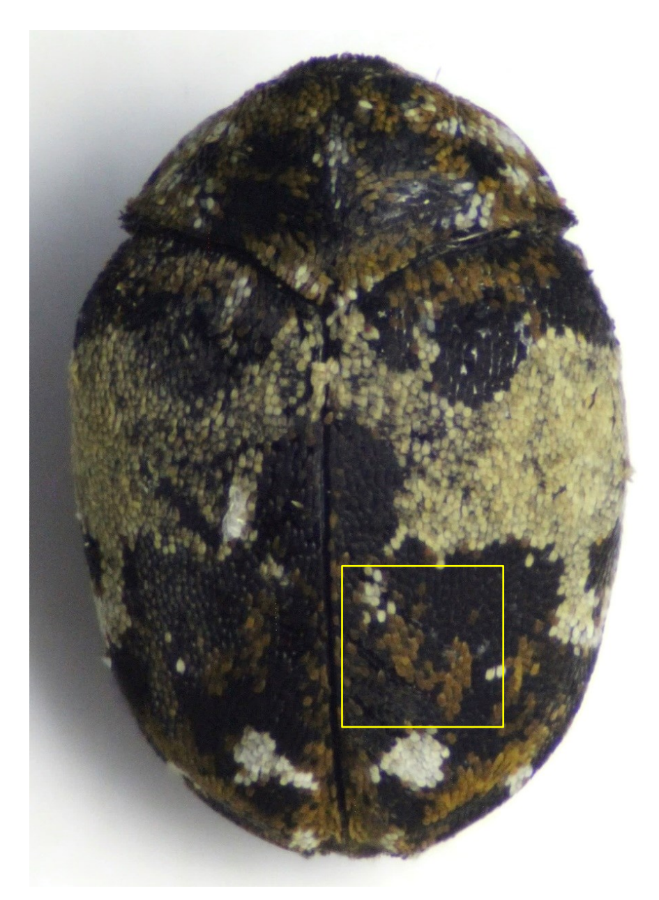
Figure 1. Example specimen of A. isabellinus showing placement of study square, positioned in contact with internal edge of right elytron, and in contact with but not including the top of the sub-apical white spot.